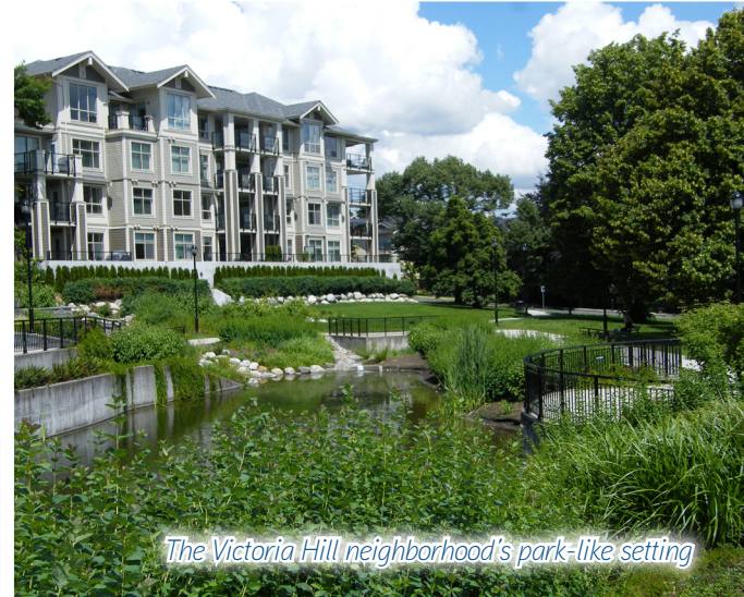
The Victoria Hill neighborhood's park-like setting