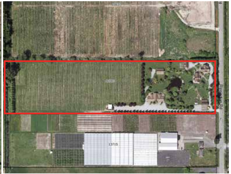
Close up aerial of 13783 Rippington Road