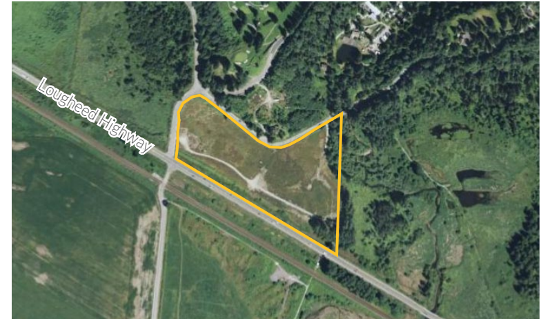
The subject property