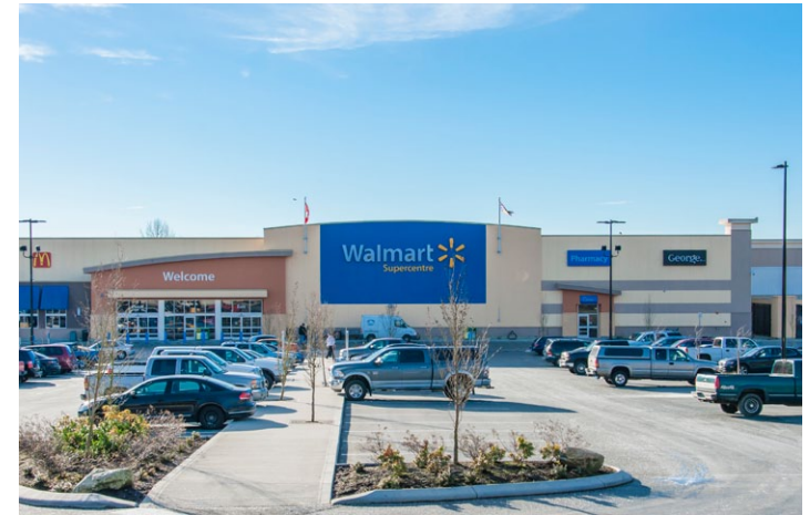
Walmart Supercenter located just east of the Property

The population of the District of Mission is approximately 39,660, which is expected to grow to an estimated 46,000 by the year 2024. During the past two decades, Mission has become a key satellite community of Metro Vancouver and the Fraser Valley. This growth trend is expected to continue and accelerate due to the high quality environment to raise families, the relative affordability and choice of area housing, and the general movement of the Metro Vancouver population and employment out to this area. The area is rich in amenities and served by an excellent grid of highways and arterials.