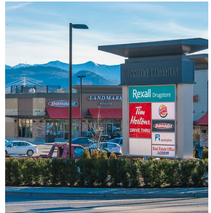
New retail at Mission Common, east of the Property