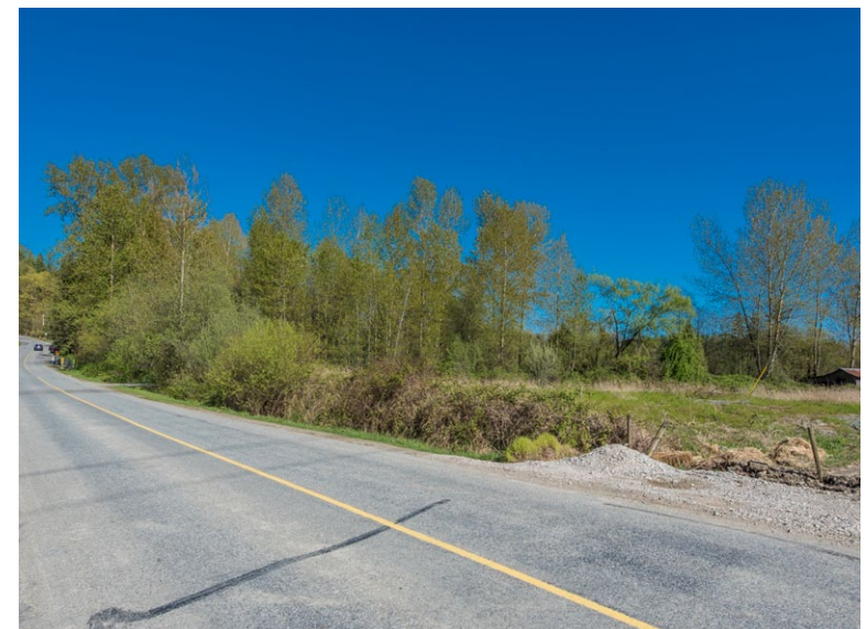
View of the Property along Nelson Street