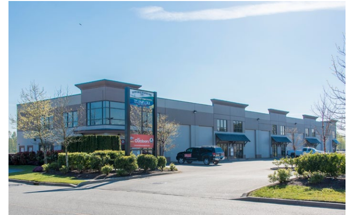
Retail/Office at Silver Creek Business Park