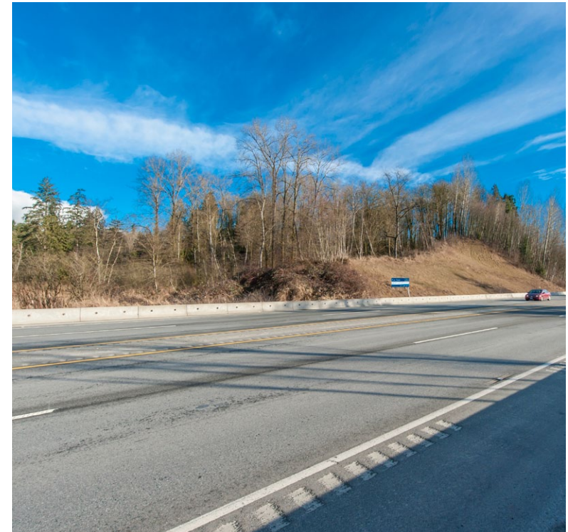
West side of Property as seen from Lougheed Highway.