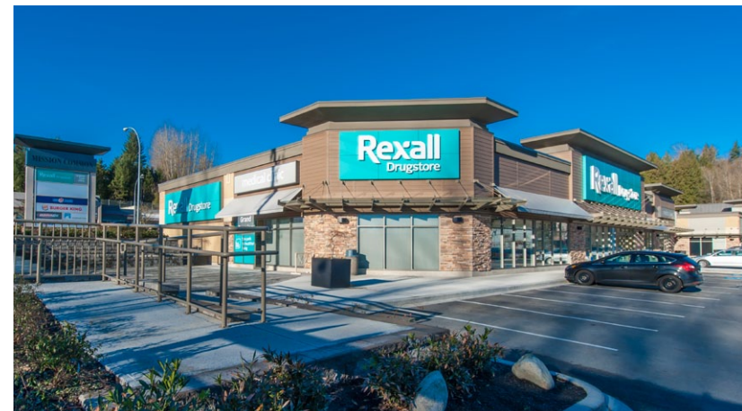
Rexall Drugs opened near the Property in 2013