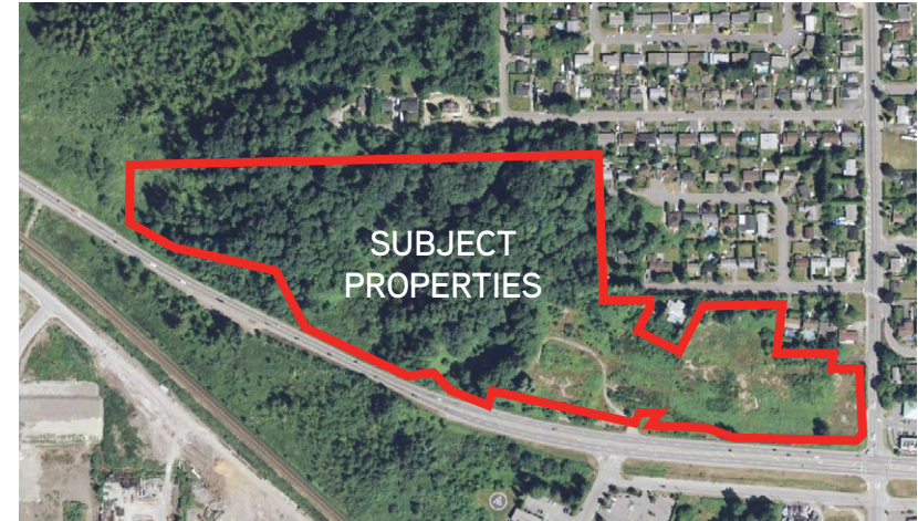
High exposure property.

The subject has excellent potential for development, given its high exposure, size and configuration.