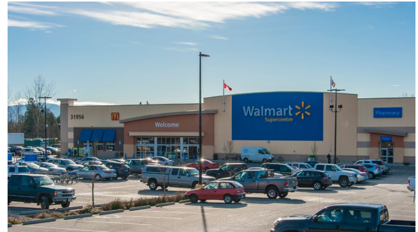
Walmart opened in 2012 and is directly across from the Property.

Prospective purchasers are invited to submit Offers to Purchase the 31802 Hillcrest Avenue, 31831 Lougheed Highway, 31941 Lougheed Highway, 31971 Lougheed Highway, and 7233 Wren Street through Colliers for consideration by the Vendor.