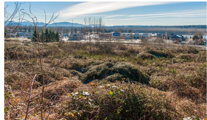
River views to the South.