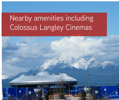
Nearby amenities including Colossus Langley Cinemas