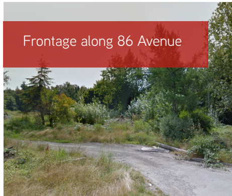
Frontage along 86 Avenue