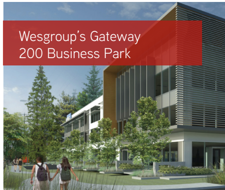
Wesgroup's Gateway 200 Business Park