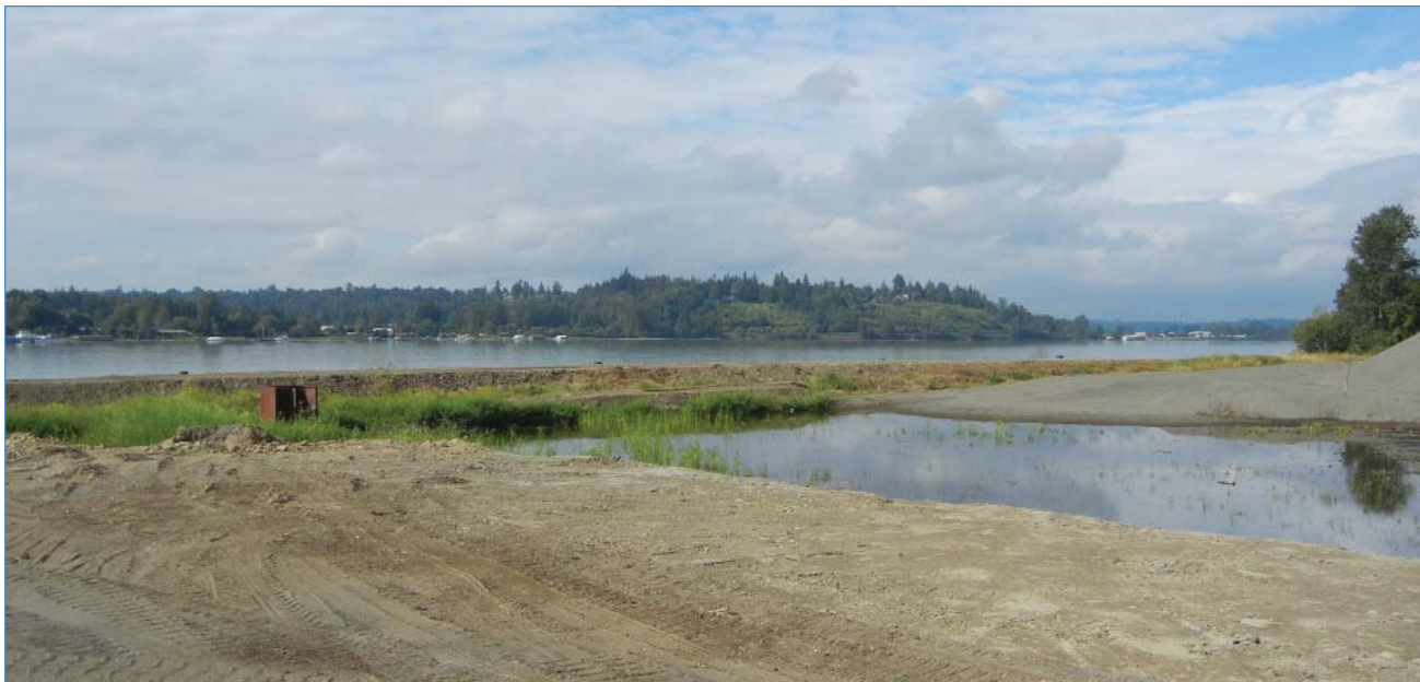
FRASER RIVER FRONTAGE