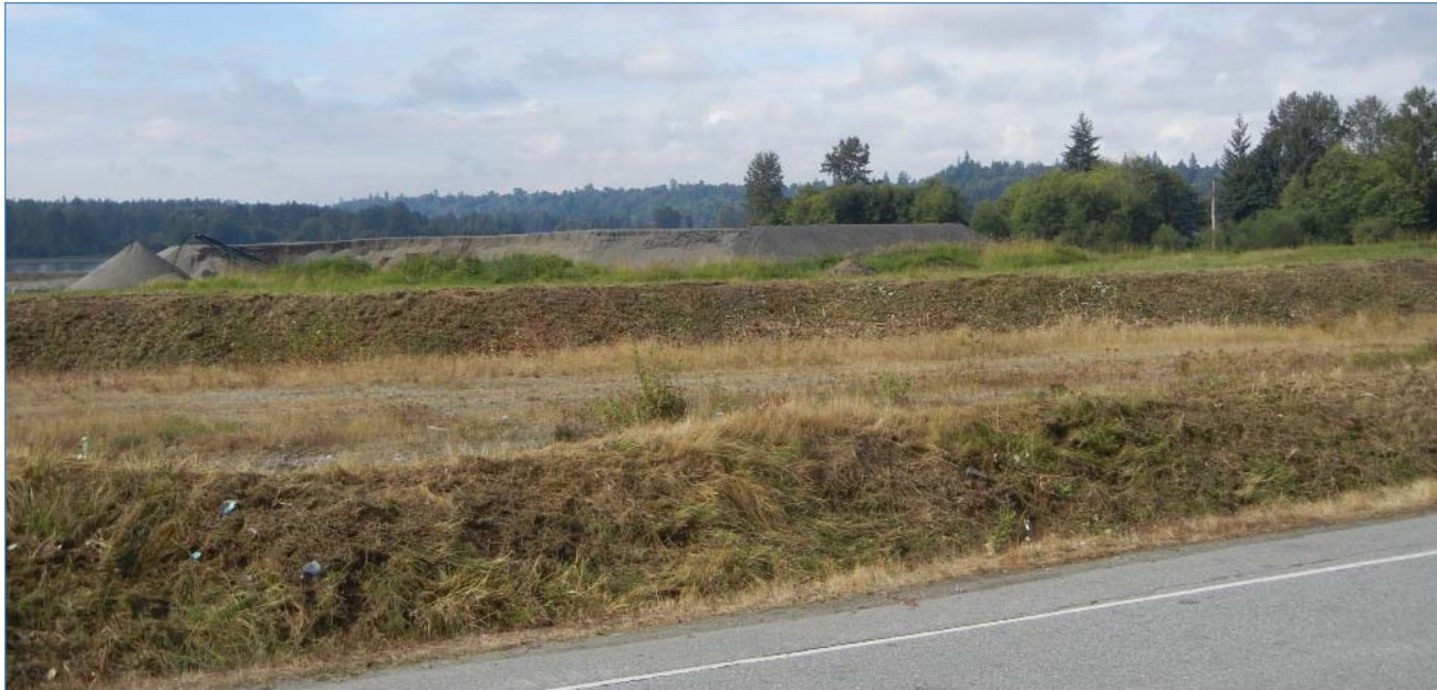
SUBJECT PROPERTY FROM LOUGHEED HIGHWAY